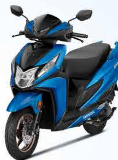
MAT MARVEL BLUE METALLIC