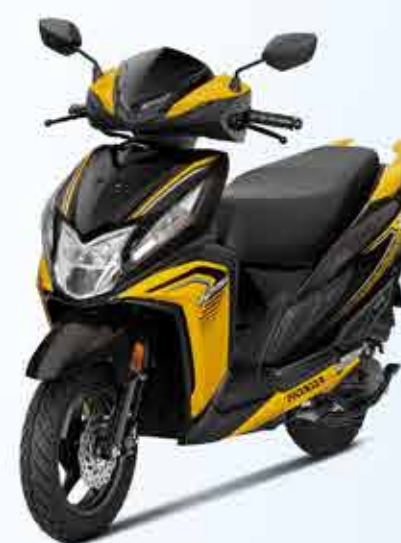
PEARL SPORTS YELLOW